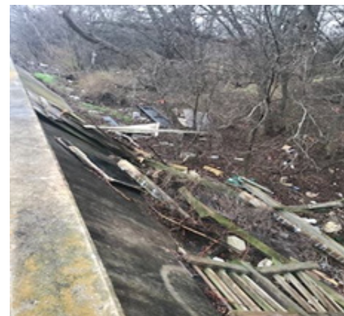
Some of the trash and bulk illegally dumped in the creek bed behind Whataburger. The A-Team helped remove 70 tons of trash.

We as a community need to be aware that all the trash that we see along our streets goes into our storm drains clogging them and causing possible flooding. Our rivers and streams also suffer from all the trash that flows into them. Take better care of our community - REPORT illegal dumping to 311 .