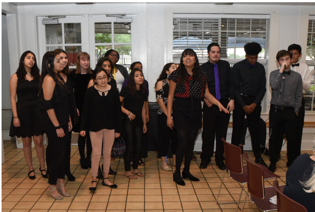
The Warren High School acapella group, Zero Hour, provided music during the Volunteer's Reception at the Annual Meeting