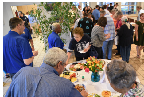
Attendees enjoyed refreshments during the Volunteer's Reception.