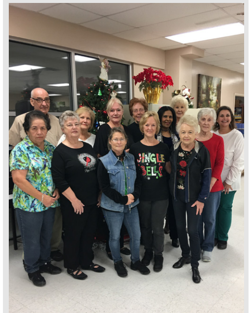
SHAKE IT UP INTERMEDIATE LINE DANCING MONDAYS • 10 -12 • 8809 TIMBERWILDE

Shake It Up Line Dance Club is an easy intermediate level class. It's for those who have mastered the beginner basics and want to step it up another level and learn new, more challenging dances. This club has a faithful core group that now meets at the GNW Lodge on Monday mornings from 10:00-12:00. We welcome anyone who wants to join and enjoy it as much as we do!